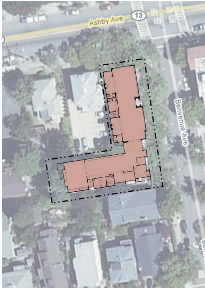
OPTION A Renovation - 7,300 SF