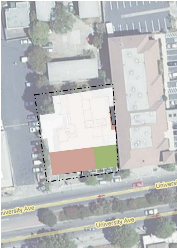
OPTION A Renovation 2,100 SF + 6,560 SF Addition = 8,660 SF