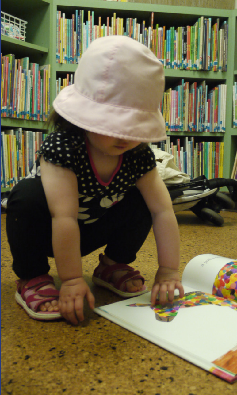
Claremont's picture book alcove is a much-loved destination for our youngest neighbors!