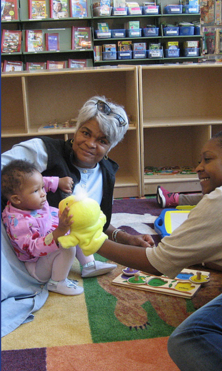
The Library's Family Place is part of a national model for family-centered service to young children, parents, and caregivers.