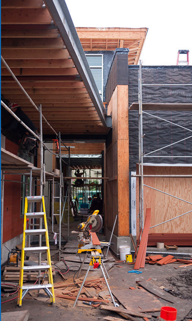
Construction is progressing on schedule at South Branch.