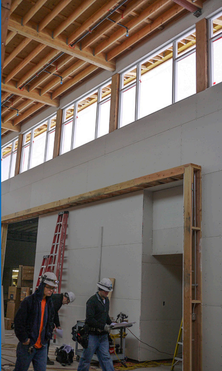
The new library will feature an abundance of natural light.