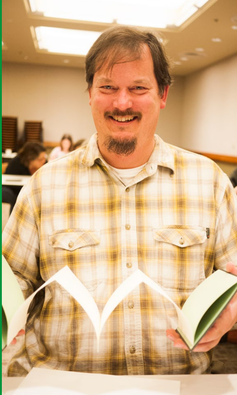
Participants made unusual accordion-style hand-bound books at the Library's well-attended bookbinding workshop.