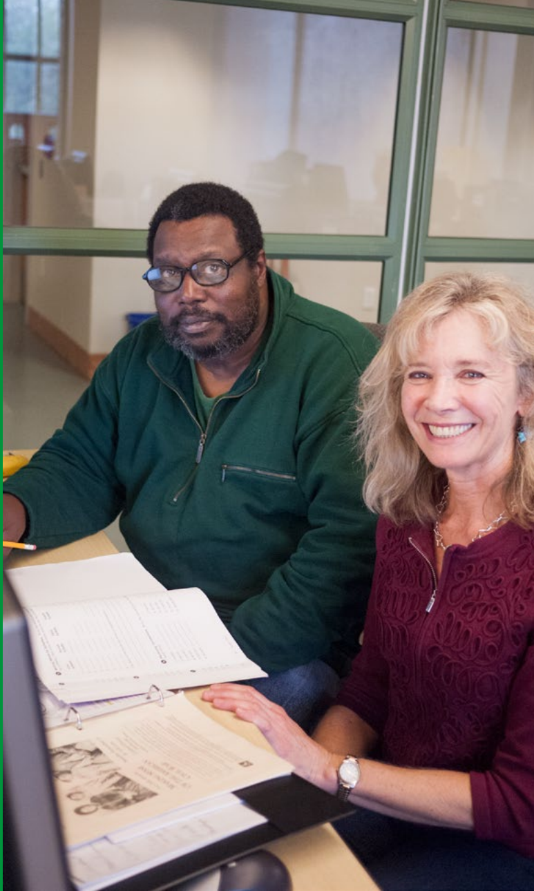
The Berkeley Reads Adult Literacy program offers one-on-one tutoring with trained volunteers.