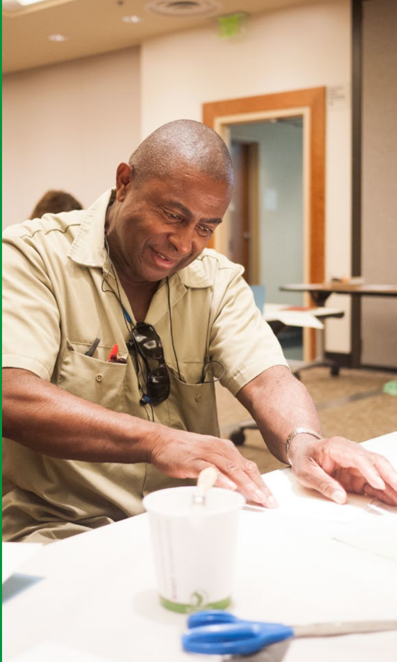
Participants made unusual accordion-style hand-bound books at the Library's well-attended bookbinding workshop.