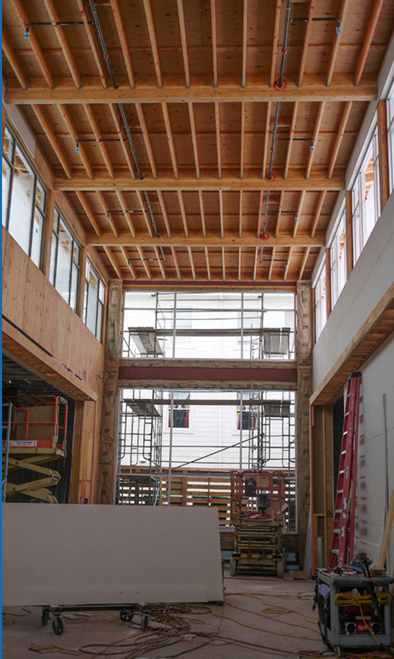
The new library will feature an abundance of natural light.