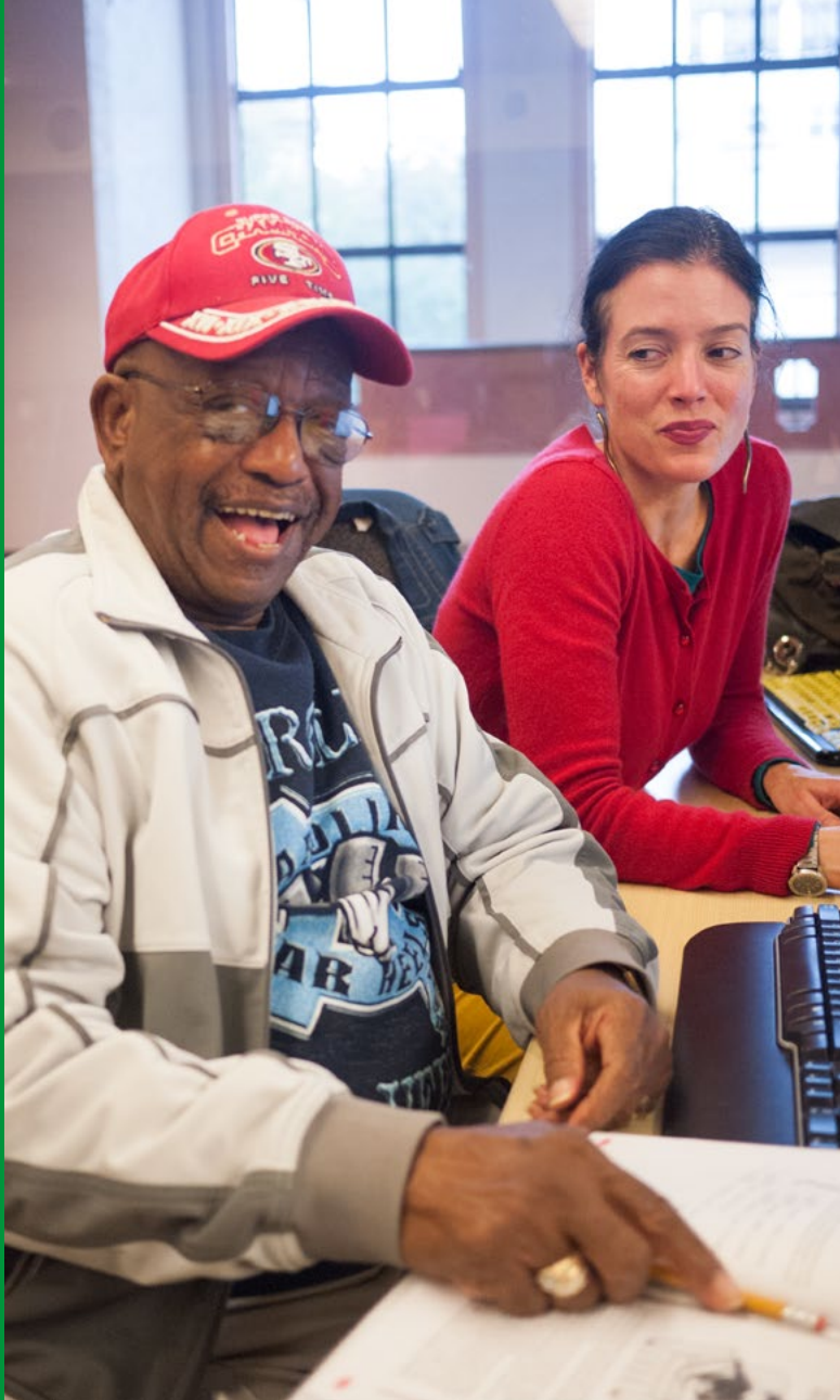
The Berkeley Reads Adult Literacy program offers one-on-one tutoring with trained volunteers.