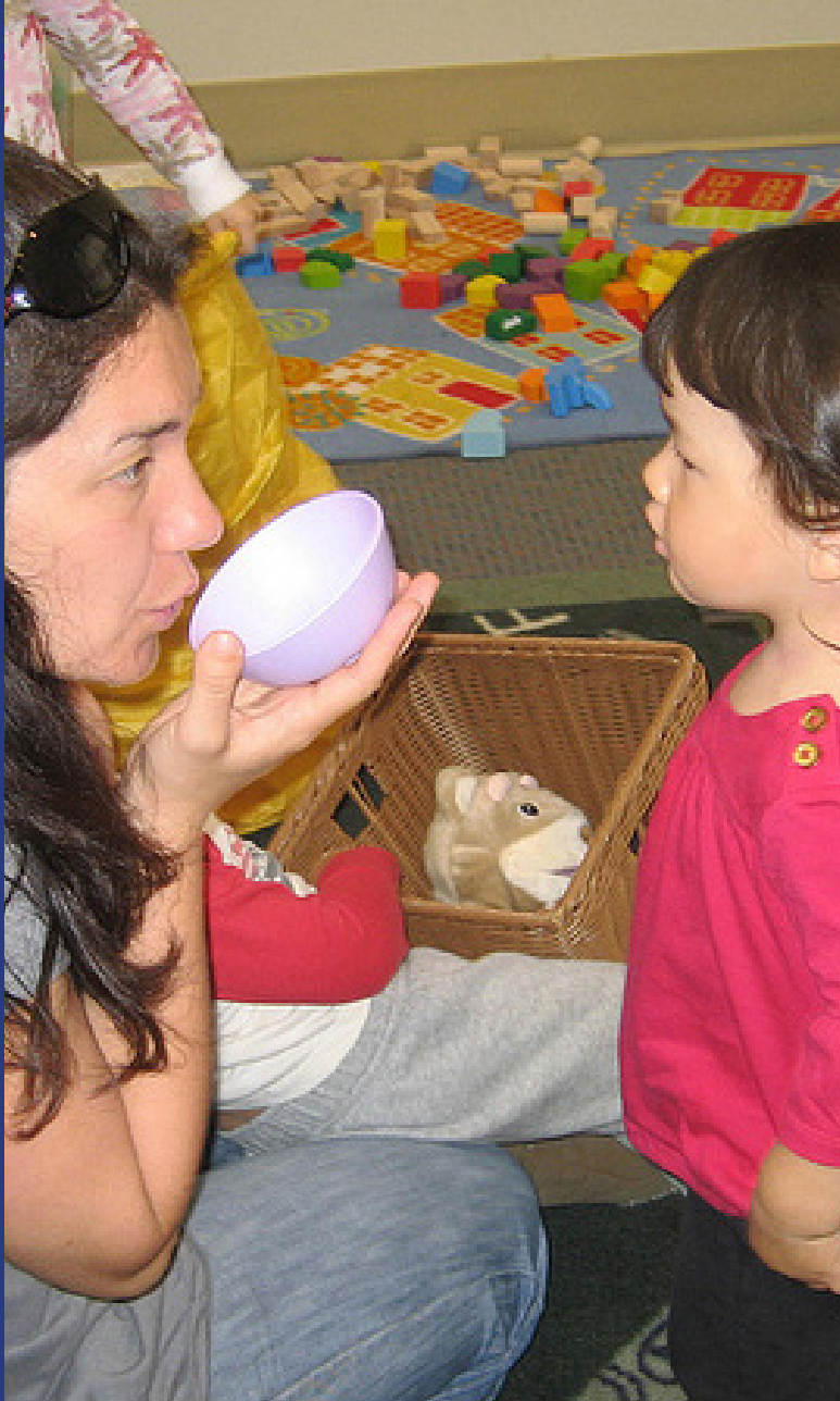
The Library's Family Place is part of a national model for family-centered service to young children, parents, and caregivers.