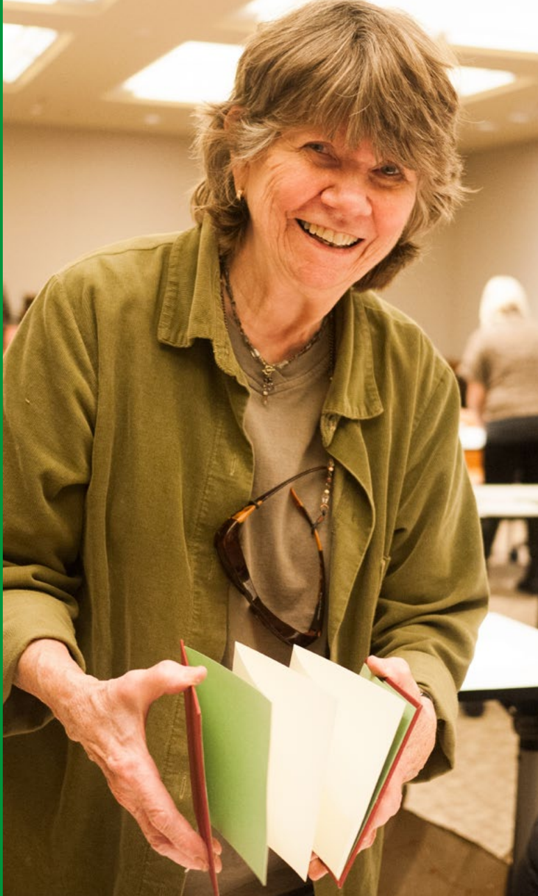
Participants made unusual accordion-style hand-bound books at the Library's well-attended bookbinding workshop.