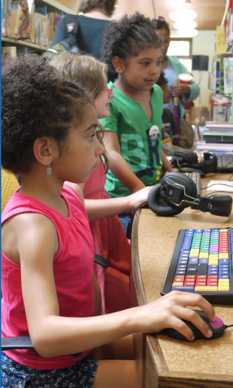
Younger celebrants explored the computers in the updated and expanded children's area.