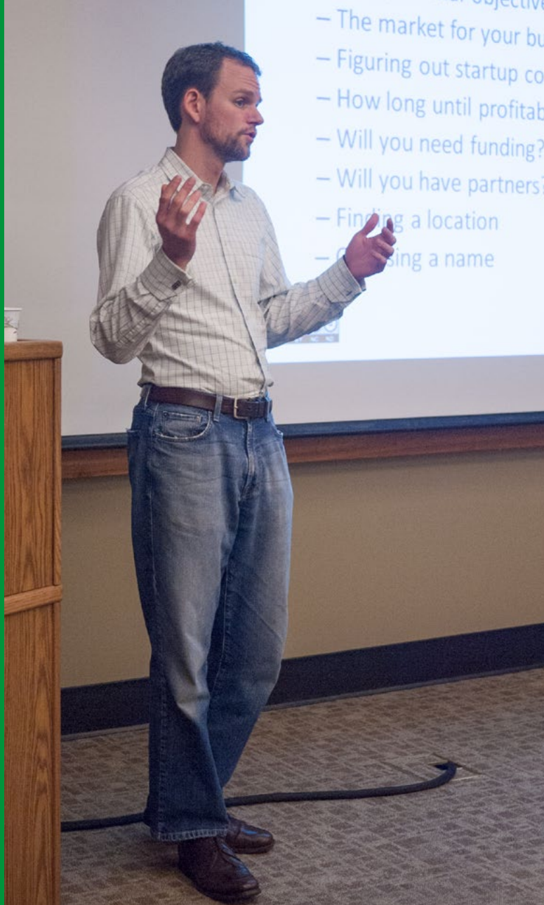
Local small business owners learned about affordable legal resources at a recent workshop for new entrepreneurs.