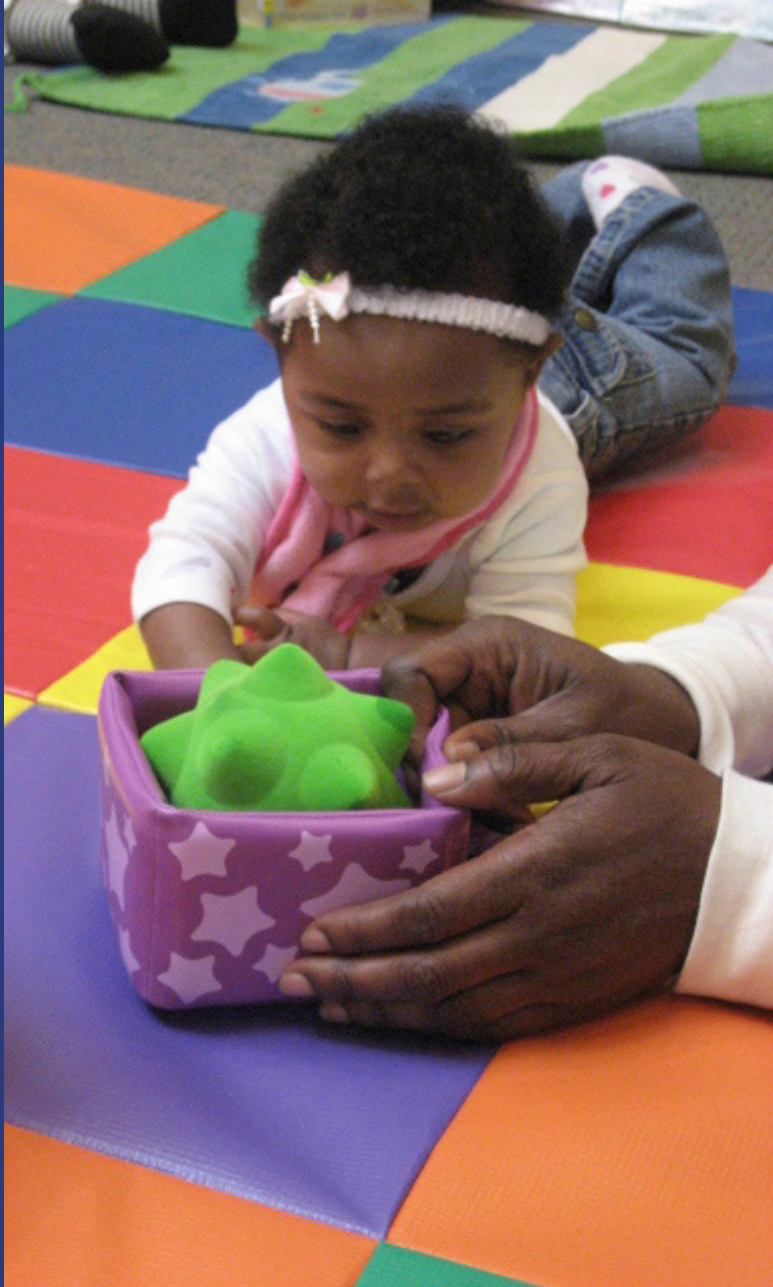
The Library's Family Place is part of a national model for family-centered service to young children, parents, and caregivers.