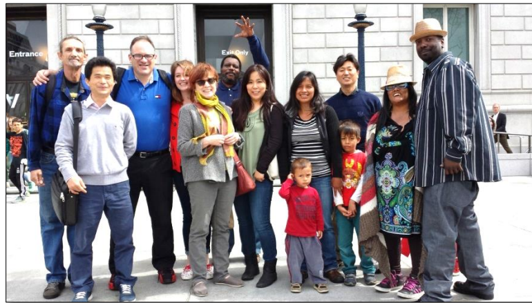
Berkeley READS students in front of Asian Art Museum