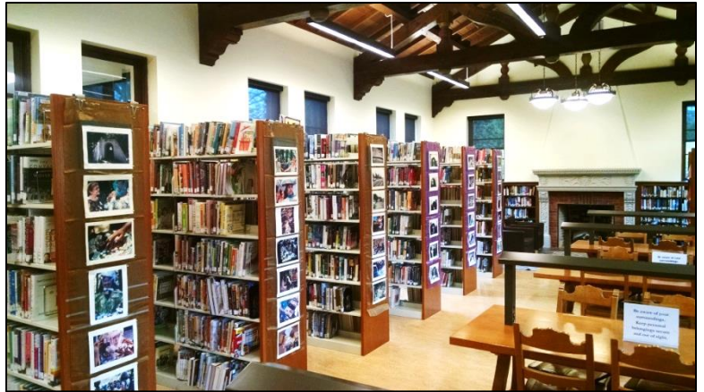
Photo Panels at North Branch