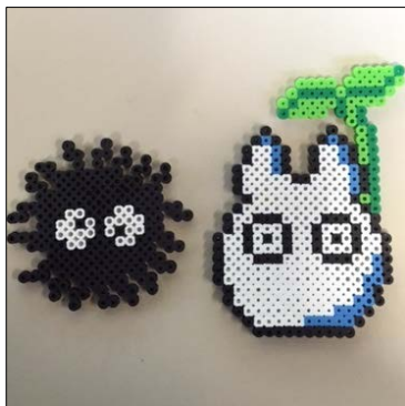
Teens Make Something! Totoro craft with perler beads